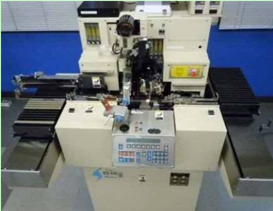
Can Type Package ( Carrier Indexing )