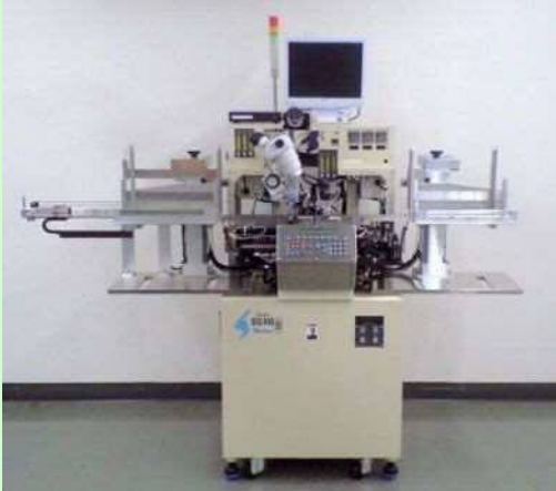
Long Length Substrate ( Individual Indexing )