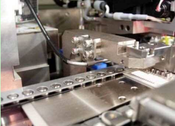
Short Length Substrate ( Individual Indexing )