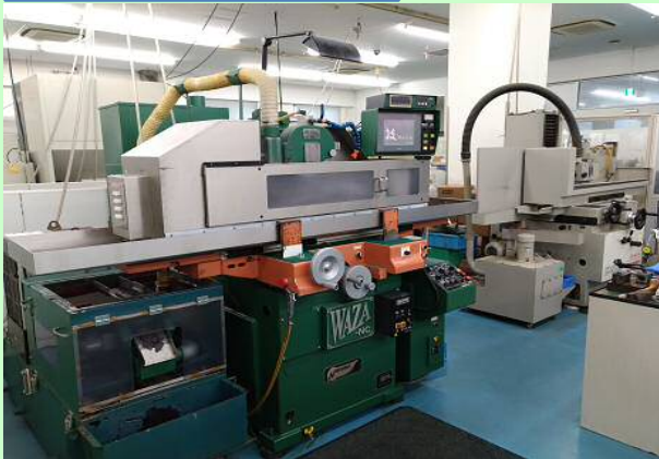
High Precision Surface Grinding Machine