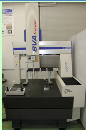
3D Coordinate Measuring Machine