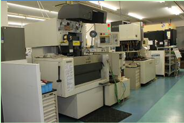
Wire EDM / Diemilling EDM